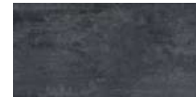
12 x 24 (11 3 / 4 x 23 5 / 8 ) FQ3T457161