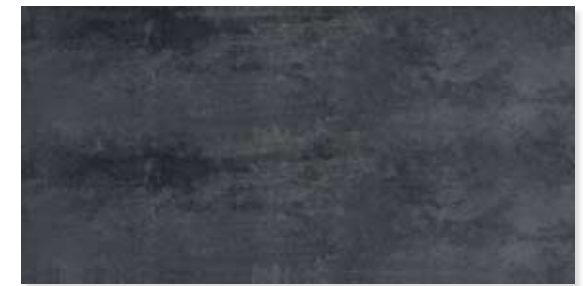
24 x 48 (23 5 / 8 x 47 1 / 4 ) FQ3T454161